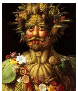
Rudolf II of Habsburg as Vertumnus

https://nationalpost.com/afterword/giuseppe-arcimboldo-the-prince-of-produce-portraiture